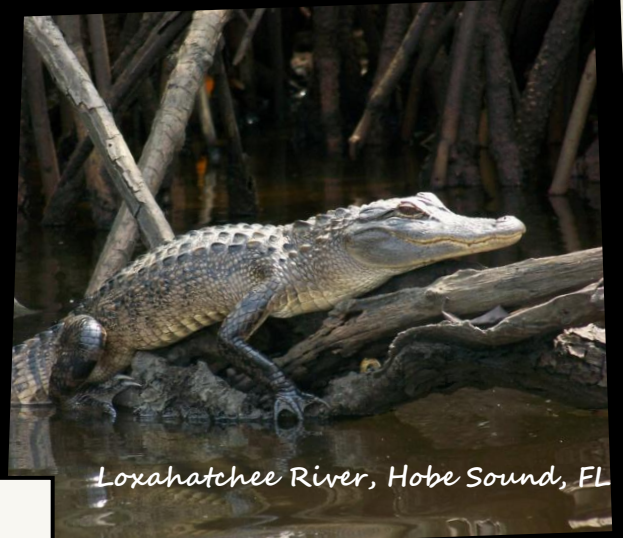
Loxahatchee River, Hobe Sound, FL