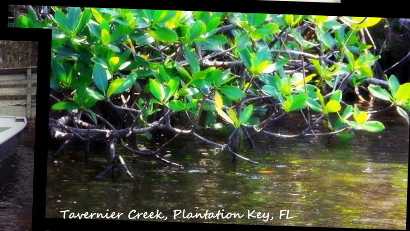
Tavernier Creek, Plantation Key, FL