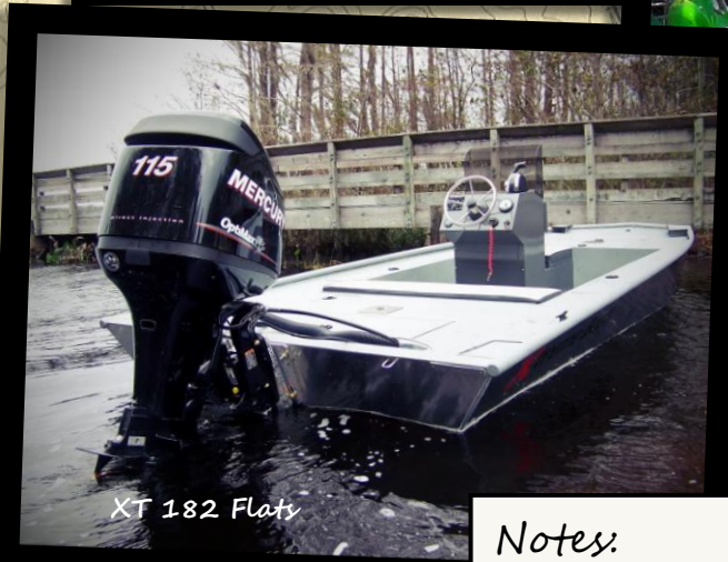
XT 182 Flats