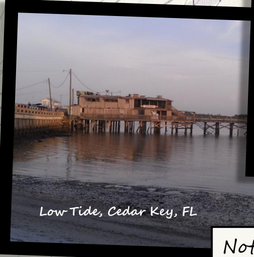
Low Tide, Cedar Key, FL