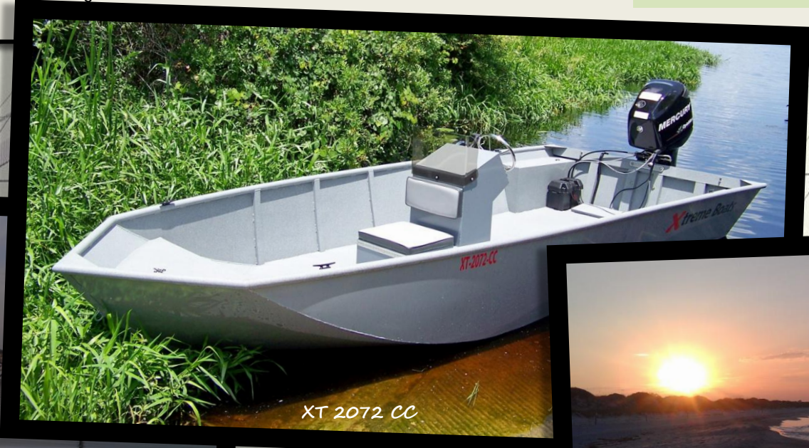
XT 2072 CC